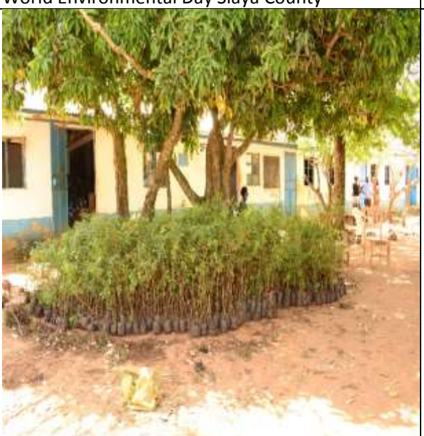
18,300 Tree Donation From Equity Bank Siaya