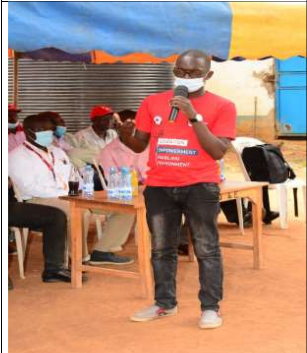
Kenya Red Cross Siaya branch Representative Giving Speech at the event