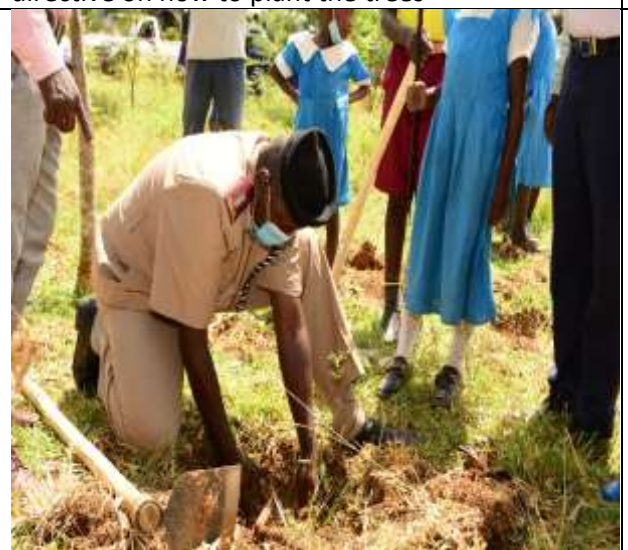
The Area Assistant Chief participating in Tree planting